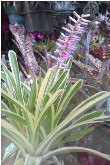
Aechmea 'Lucky Stripes'