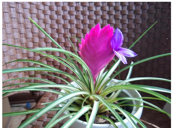
Wallisia cyanea v. variegata