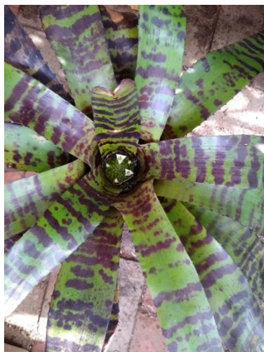
Neoregelia 'Cat's Meow'